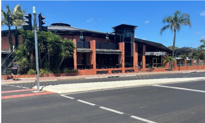
The view from across the road

The main entrance into the Arkaba is next to the carpark and opposite Frewville Foodland.