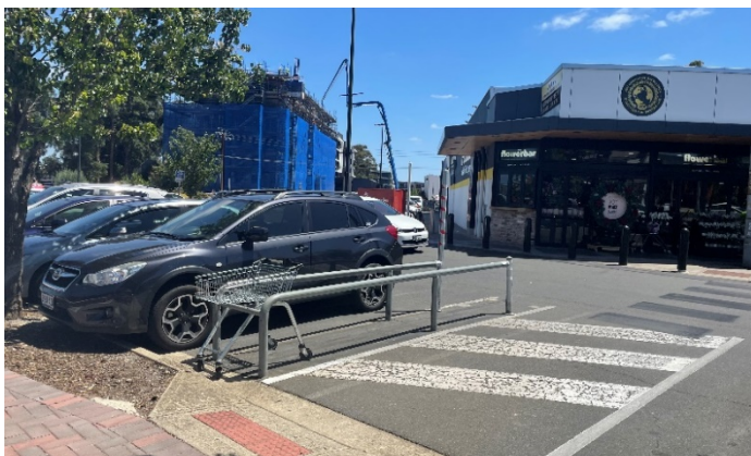
The view from the Arkaba entrance