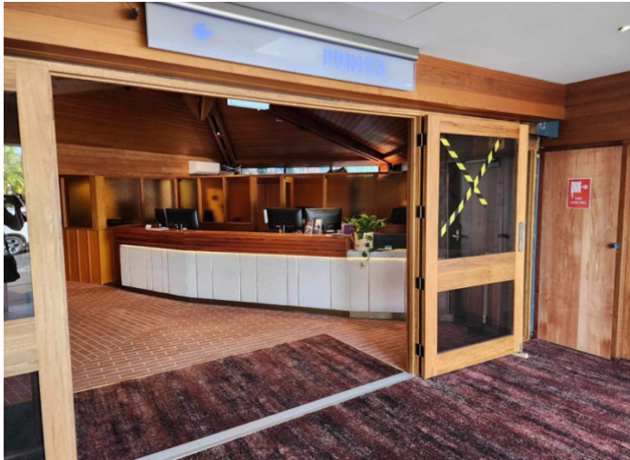
The reception area

When you walk through the main entrance you can walk straight, which will lead you into the hotel lobby. Or you can walk down the side entrance to the Gaming room and Osmond room. If you walk into the hotel lobby, there will be a desk there with staff members. You can ask them for help. You don't have to interact with them if you don't need help, but they may smile and say "hi".